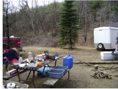
The Scoutmasters working on the trailer