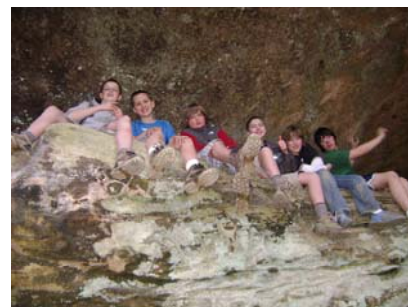
Some of us at Old Man's Cave